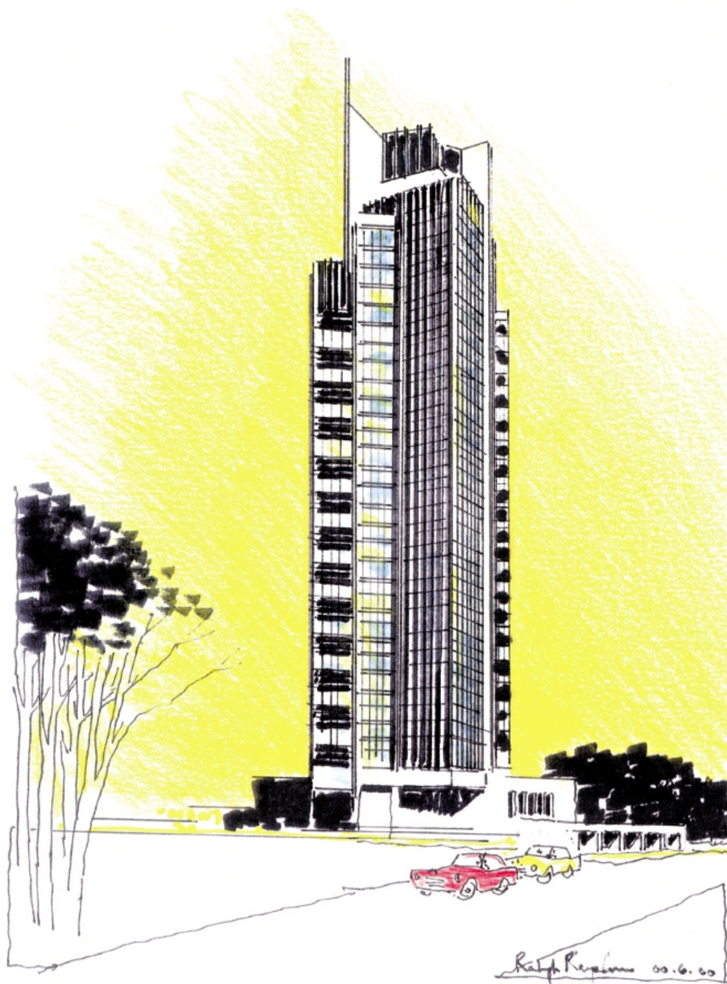
Price Tower , in Bartlesville, Oklahoma, designed by Frank Lloyd Wright , 1952 to 1956